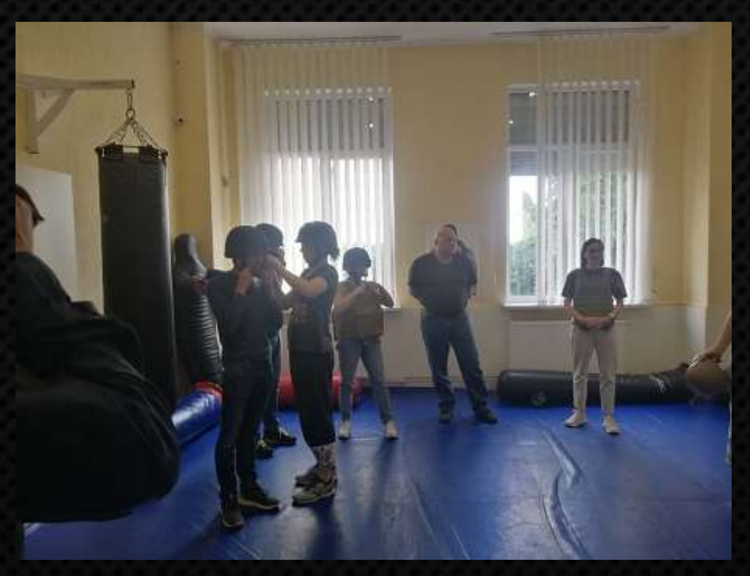
Class and sports hall in the study hall center